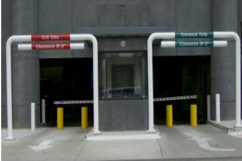
Model B-30 Bollard System

Arranged independently or as a set, the Model B-30 Bollard System incorporates dual speeds. Normal operation, which is site adjustable, and emergency fast operation (less than 1 second) for when immediate deterrence is required. The bollards also feature multiple operating methods including card reader activation, push button control, and vehicle detection to suit the characteristics of any operation.